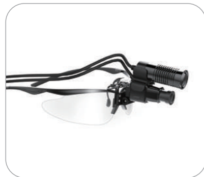
Attached to glasses