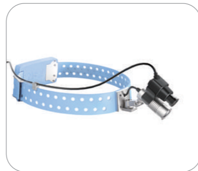
Attached to headlight