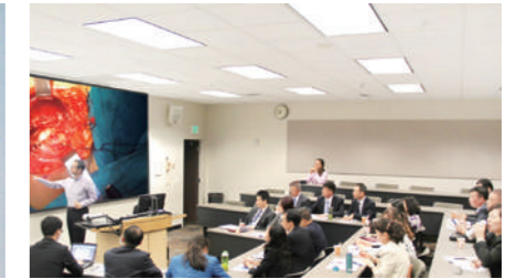
Education / Training