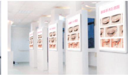
Hospital / Clinic Promotion