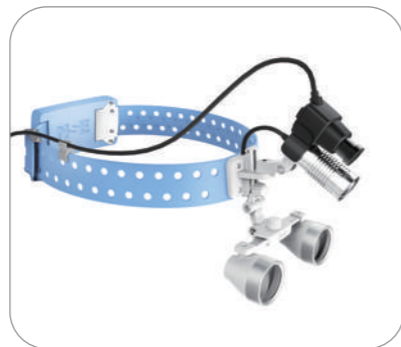
Attached to loupes