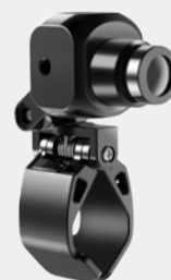
Lens with Clip