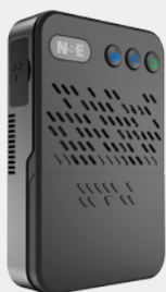
Main Unit (front)