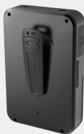
Main Unit (back)